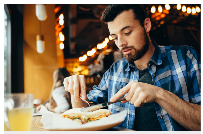
After an employee checks into the hotel and is free to engage in purely personal pursuits — like exploring the city, enjoying dinner at a nearby restaurant, watching TV in the hotel room or sleeping — this time is not compensable, which means the employee is off the clock

The Labor Commissioner's Office recently cited a fitness chain more than $8.3 million in labor law violations on behalf of employees who worked at 15 locations throughout Southern California. Some of the fitness trainers and assistants were paid only for each class taught and therefore were shorted on wages due for travel between the class sites.